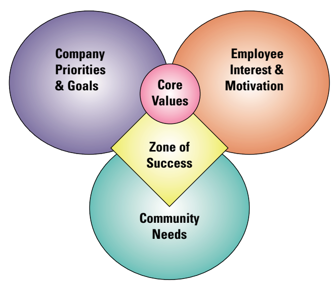
Figure C Program Success

The Employee Volunteer Program success will be determined by addressing the needs of the following three areas. First the company priorities will have been met and Volunteer Programs will have produced demonstrable results. Second, the interests of employees must be expressed and their quality of life improved through the Volunteer Program. Third, the Volunteer Program will have targeted community needs. The figure below outlines the interaction between the principle stakeholders and the need to consider the core values to ensure successful program process.